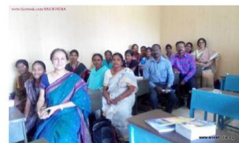
Outreach at the Presidency College