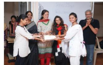
Certificate Distribution-Self Defence Course