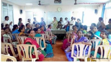
Refresher Course Certification