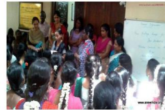
A morning assembly at ANEW ....